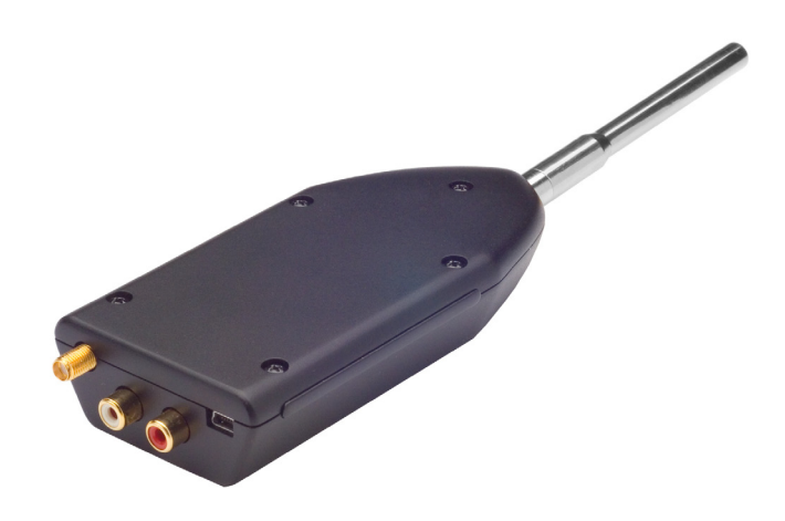
IE-45 Input Module